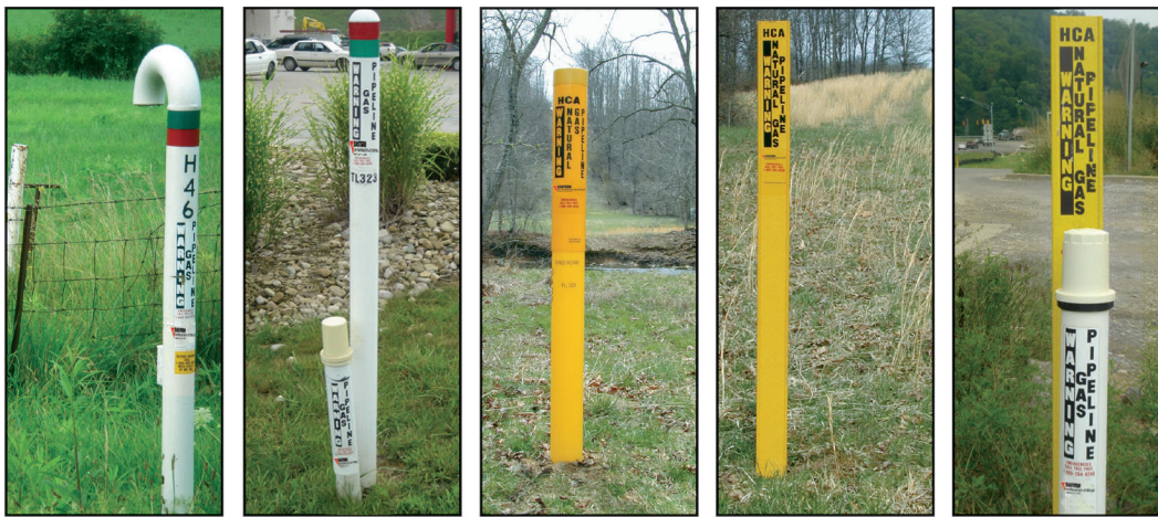
1. Vent Pipe